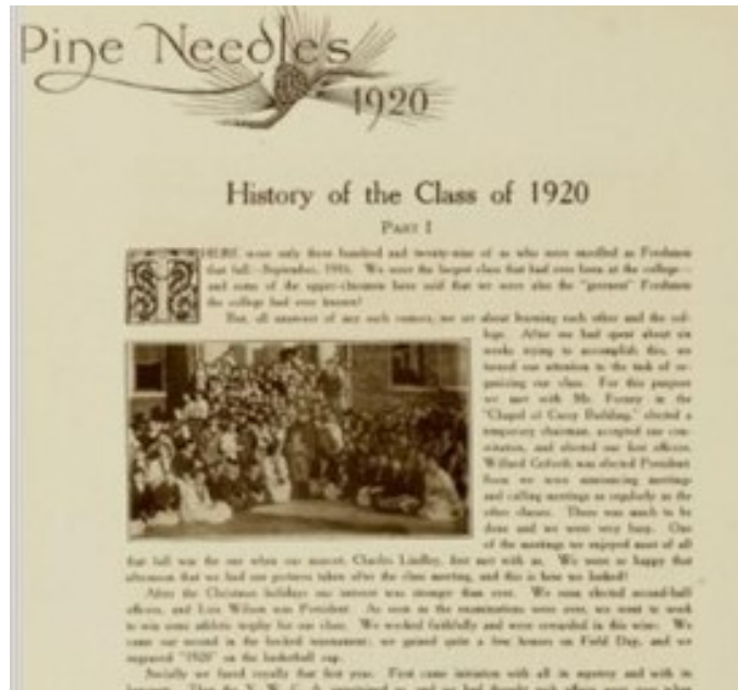
Pine Needles, Greensboro, N.C.: North Carolina College for Women, 1920.