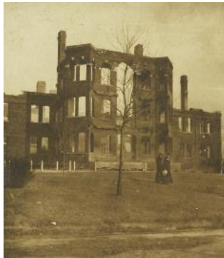
Photograph of burned out dorm, 1904