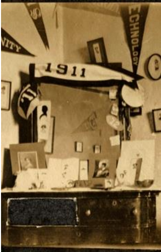
Student scrapbook, 1911