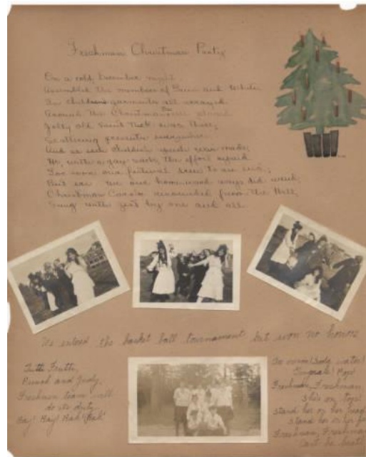
Class of 1918 Scrapbook, page 6.